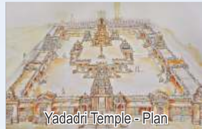
Yadadri Temple - Plan