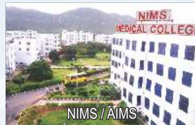
NIMS / AIMS